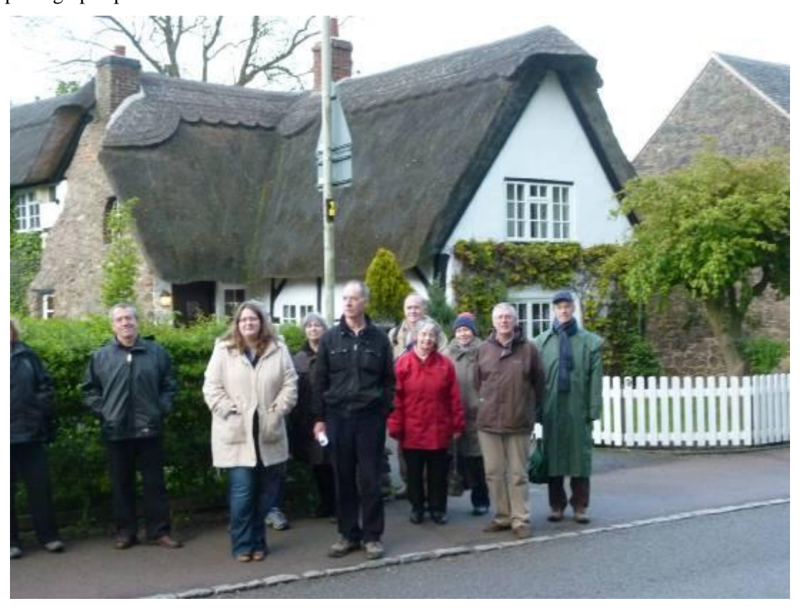
Leicestershire VCH volunteers on a recent visit to Newtown Linford.