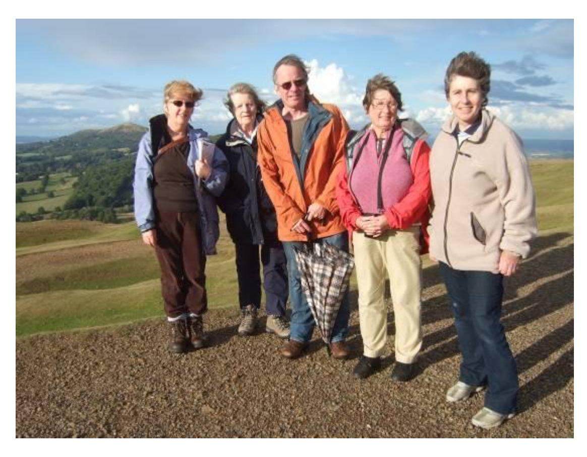
Friends almost blown away at British Camp.