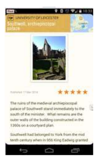
An uploaded entry to Field Trip

Field Trip is available as a free download on Android, iOS, and Google Glass.