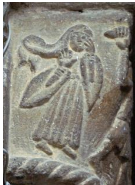
St Kyneburgha, Castor Church, Northants