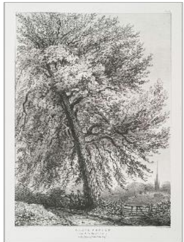
Black poplar with distant view of Ross-on-Wye

The committee request that future donations for the book sale are only of history, local history and topography books.