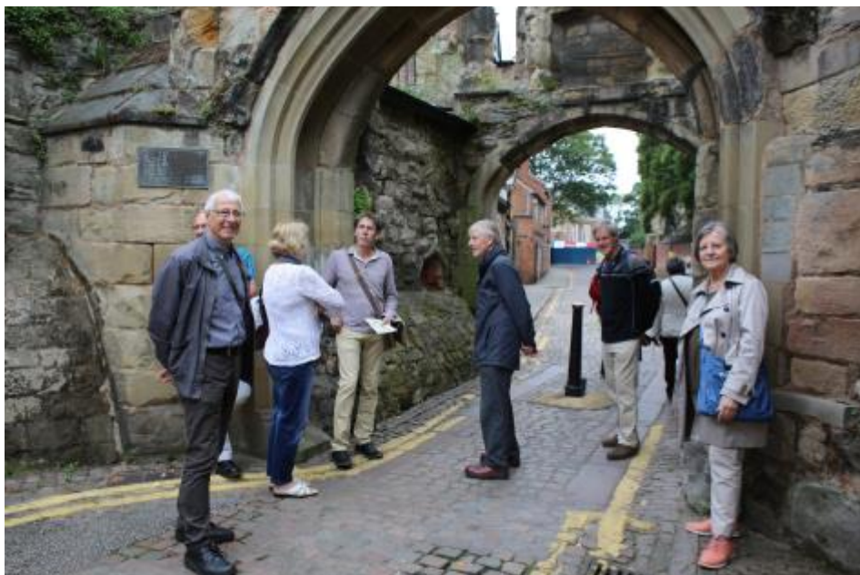
Friends in Leicester, 16 July 2016