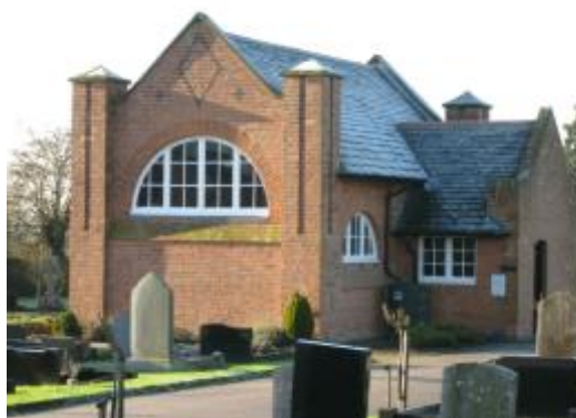
The Rothley Cemetery Chapel which will be the home of the Model and the Exhibition.

Vol. 1 H. Fox, The Evolution of the Fishing Village: landscape and society along the South Devon coast, 1086-1550. £7 inc. p&p.